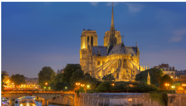
Notre Dame Cathedral - Paris, France