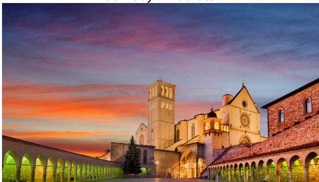
St. Francis of Assisi Basilica