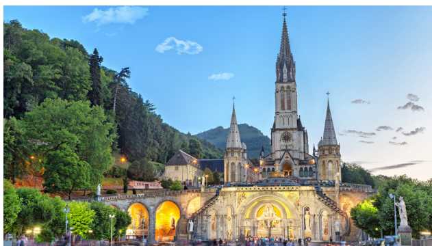
Our Lady of Lourdes